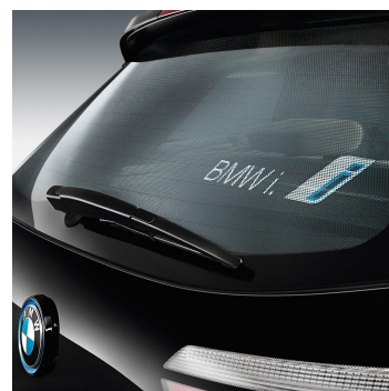
BMW i Rear Sunshades