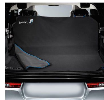
BMW i Function Cover