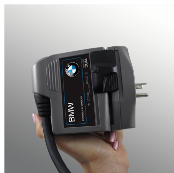
BMW TurboCord Charger