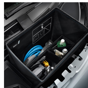
BMW i Onboard Bag