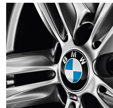
BMW Hub Cap $17.50