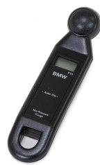
BMW Electronic Tire Pressure G... $22.00