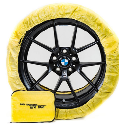
BMW Emergency Tire Tote $14.25