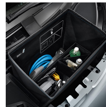
BMW i Onboard Bag $110.00