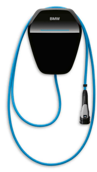
BMW Wallbox Essential $1,250.00