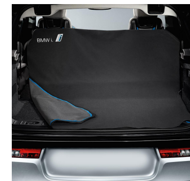
BMW i Function Cover $139.00