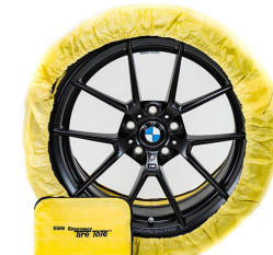
BMW Emergency Tire Tote