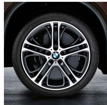
BMW Double Spoke 310M 21" Whee...