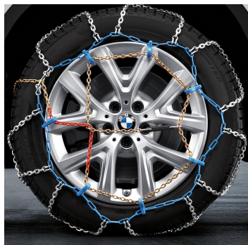
BMW Comfort Snow Chains