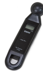
BMW Electronic Tire Pressure G...