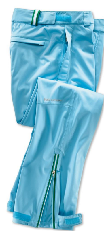
BMW Golfsport Ladies' Rain Pan...