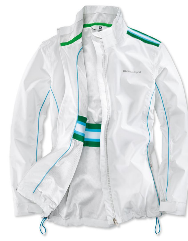
BMW Golfsport Ladies' Function...