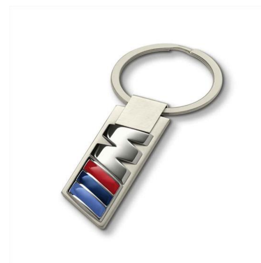
BMW M LOGO KEY RING