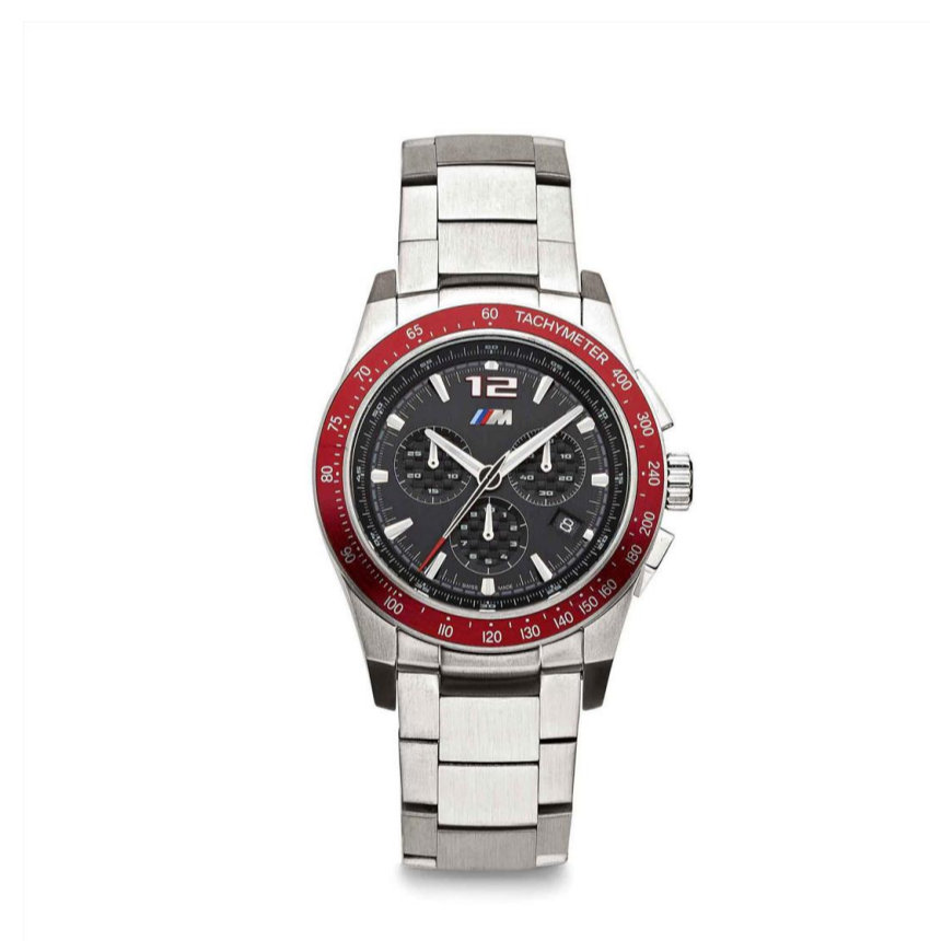
BMW M CHRONOGRAPH WATCH